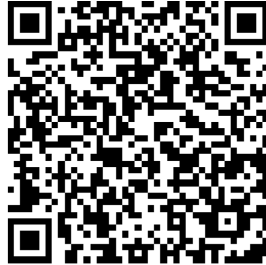
Survey Provider Survey